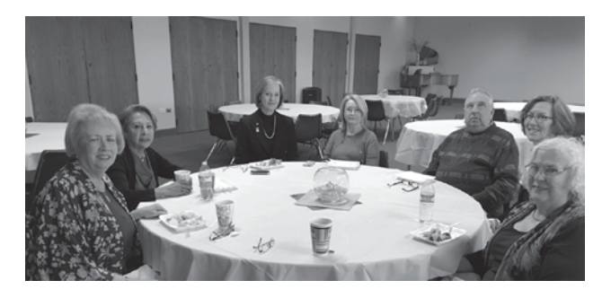
Members and guests enjoy potluck prior to the Finals